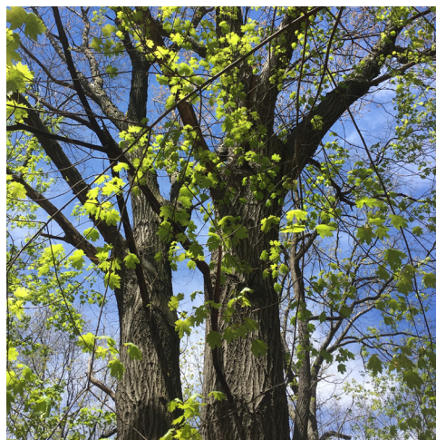
IMAGES BY ELLEN FARRELL, OMEGA INSTITUTE, 2008; VAN CORTLANDT PARK, RIVERDALE, NYC, 2017